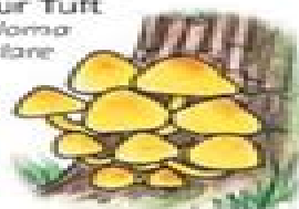
Sulphur Tuft Hypholoma fasciculare