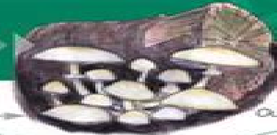
Porcelain Fungus Gudermannia mucida