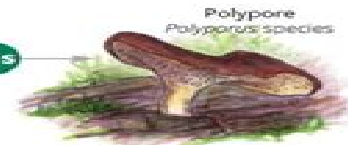
Polypore Polyporus species