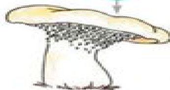
Wood Hedgehog Hydnum repandum