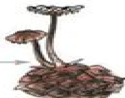
Earpick Fungus Auriscalpium vulgare