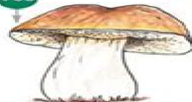
Penny Bun Boletus edulis (or one of its many relatives)