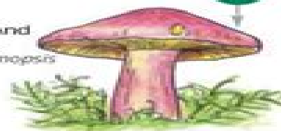
Plum and Custard Tricholomopsis rutilans