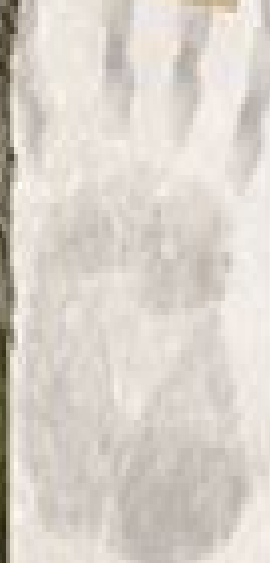
As seen in the book, the dragon rider's duty is to protect the peace and maintain the balance between the light and the dark.

The dragon rider's duty is to protect the peace and maintain the balance between the light and the dark. It is a noble and dangerous task, one that requires great strength and courage. The dragon rider is the guardian of the land, the defender of the innocent, and the bringer of peace.