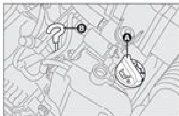
fig. 204 – 1.2 and 1.4 s versions

The oil level should never exceed the MAX line.