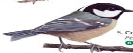
5. Coal Tit Periparus ater S