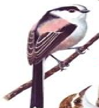
8. Long-tailed Tit Aegithalos caudatus S