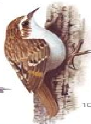
10. Tree Creeper Certhia familiaris S