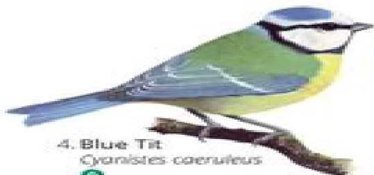
4. Blue Tit Cyanistes caeruleus S