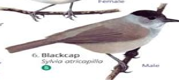
6. Blackcap Sylvia atricapilla S