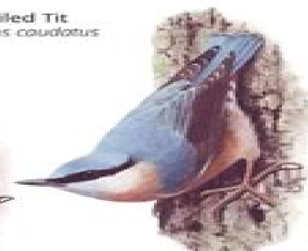
11. Nuthatch Sitta europaea S

Illustrations are not to scale Size: S small M medium L large