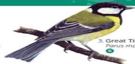
3. Great Tit Parus major S