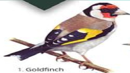
1. Goldfinch Carduelis carduelis S