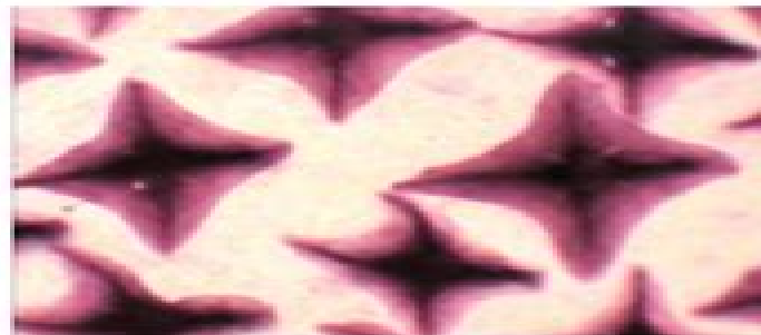
Photomicrograph of placoid scales 100X

The skin of the shark is covered with placoid scales. These scales give the skin a rough "sand-paper" texture.