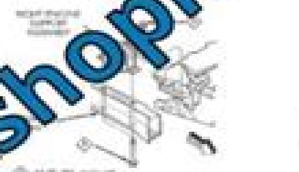
Fig. 22 Engine Mounting—Right Side