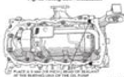
Fig. 24 Oil Pan Sealing