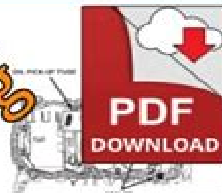
Fig. 25 Oil Pan Gasket Installation