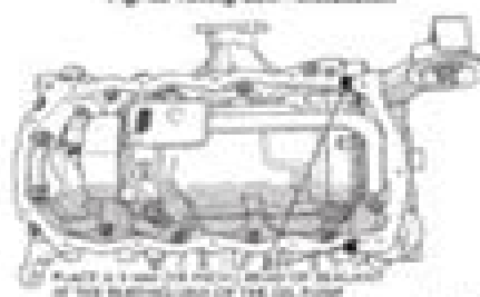
Fig. 24 Oil Pan Sealing