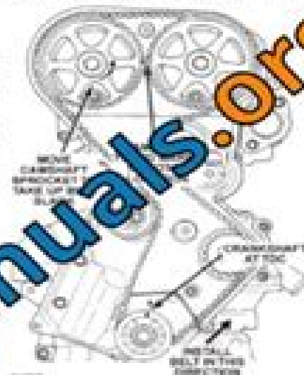
Fig. 23 Timing Belt—Installation