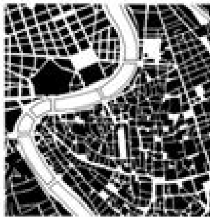
SAN FRANCISCO 1900 1900