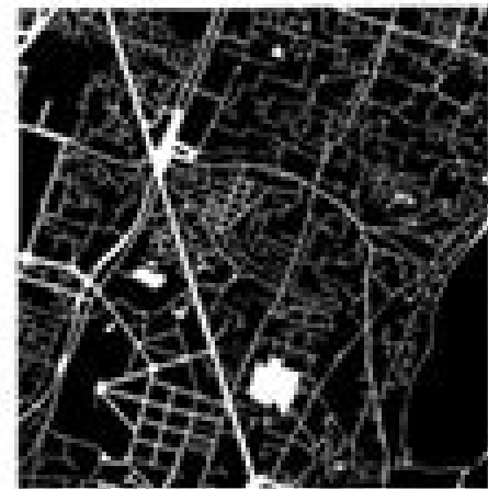
SAN FRANCISCO 1900 1900