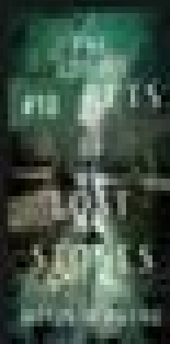
The Secrets of Lost J.K. Rowling