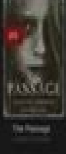
The Passage Justin Cronin