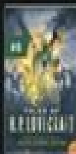
Taken of M. P. J.K. Rowling