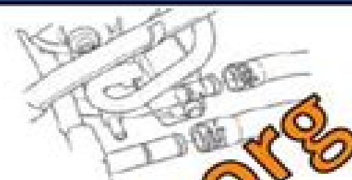
Fig. 23: Identifying Harness Hoses

Raise the voltage on the bolt to full bright. Connect the power steering pressure switch connector (A).