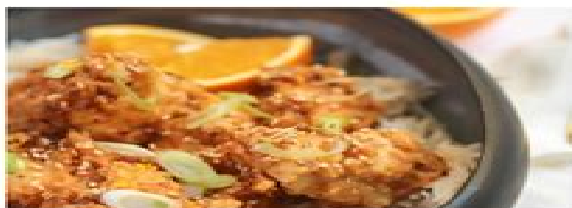
LIGHTER ORANGE CHICKEN

487 CALORIES | 33 PROTEIN | 41 CARBS | 25 FAT% | SERVES 4