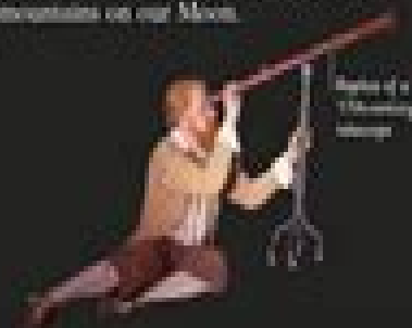
Sketch of a 17th-century telescope.

The Italian astronomer Galileo Galilei built a simple telescope in 1609 and proved Copernicus had been right. He discovered Venus had phases (like our Moon), he saw Jupiter's moons, and he spotted mountains on our Moon.