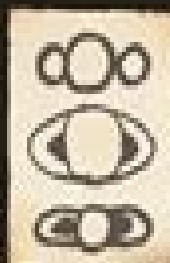
Saturn as described by Galileo – he thought Saturn's rings were two moons or 'ears'.

People were shocked when Polish astronomer Nicolaus Copernicus suggested in 1543 that the Earth was just another planet and the planets orbited (went around) the Sun. Then, it was a common belief that the Earth was at the centre of the Universe.