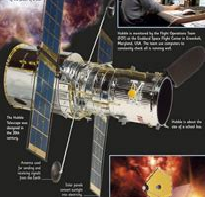
The Hubble Telescope was launched in the 1990s.

Hubble has taken incredibly detailed images, such as this one of the birth of a star.