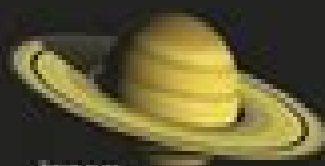
Saturn as we know it today.