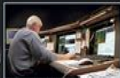
Hubble is serviced by the Flight Operations Team (FOT) at the Goddard Space Flight Center in Greenbelt, Maryland, USA. The team use computers to constantly check all its working well.