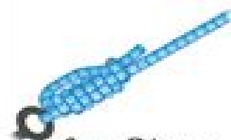
San Diego Jam Knot