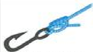
Improved Clinch Knot