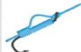
Egg Loop Knot