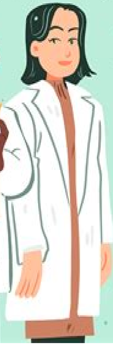
Resident (Physician pursuing 2-7 years of specialized training)