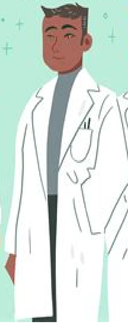
Fellow (Physician pursuing post-residency training)