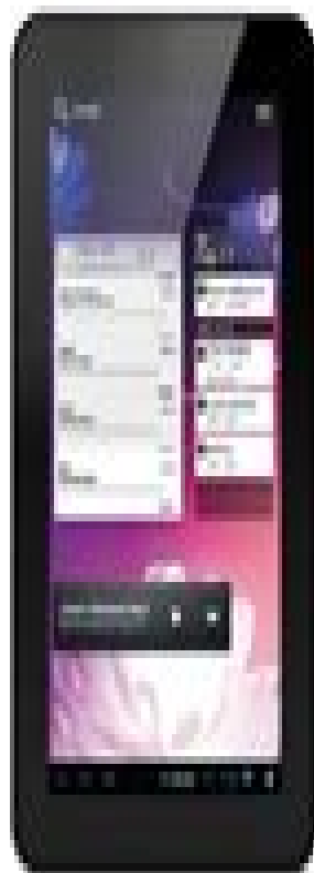
Gematic - GEM66 Quick Start Guide