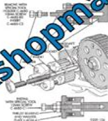
Page 2 of 2028 - 2028 - 2028