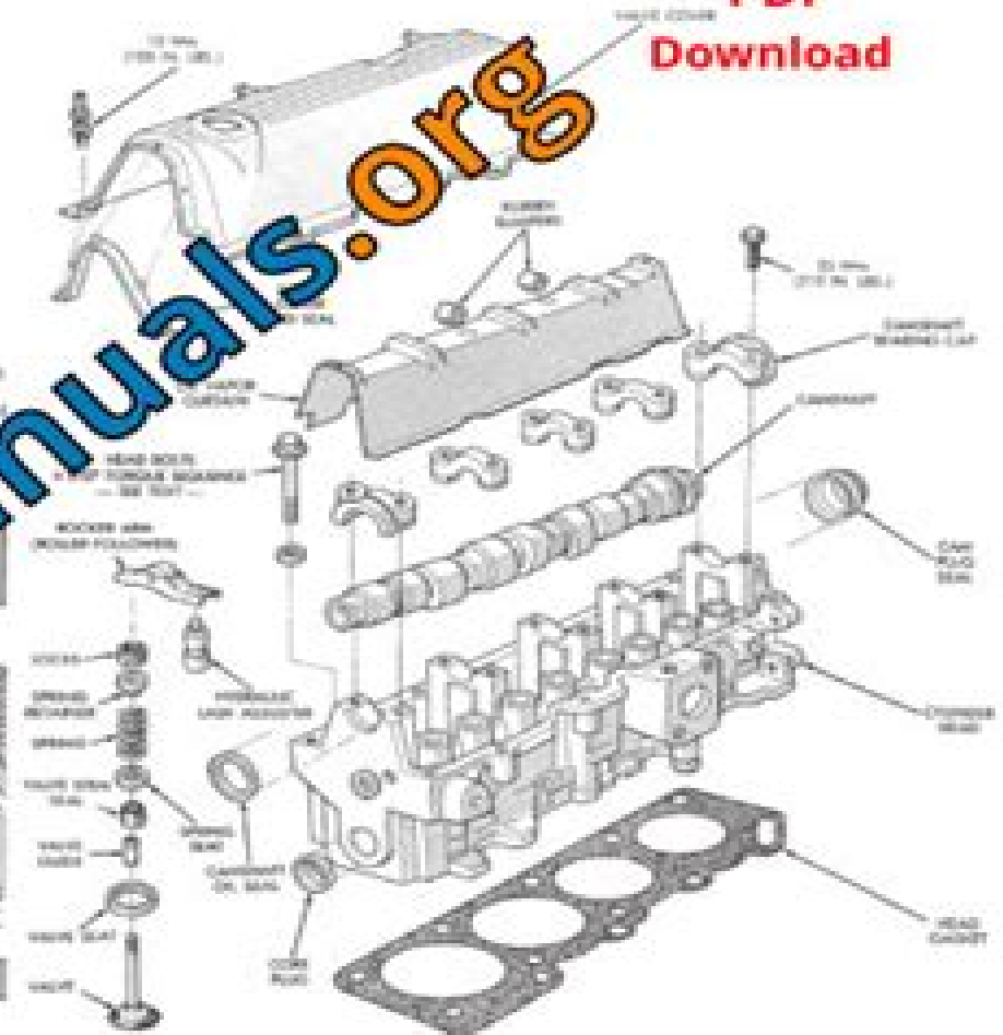
Fig. 3. Cylinder Head and Valve Assembly Details