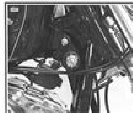
Figure 2-81. Center Cable Routing