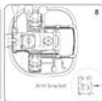
8. Locate arm width adjustment bracket affixed under seat. Move lever to unlocked position.