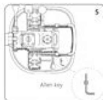
5. Locate Allen key under seat.