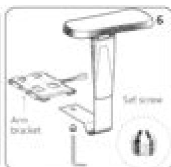
6. Slide arm out of the width bracket. Back out set screw of the hole located in the arm, using the Allen key to loosen.