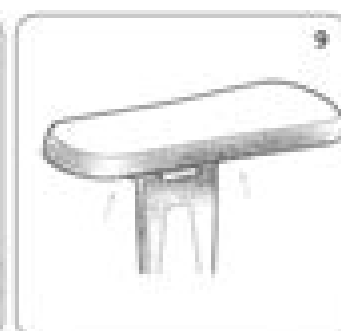
9. The arm pad can be removed from arm bracket by unscrewing the two (2) bolts under the arm pad. This can be performed with a Philips screw driver.