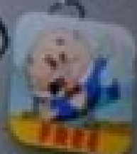
Nursery TV 4