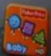
Shapes & Co.