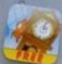
Nursery TV 2