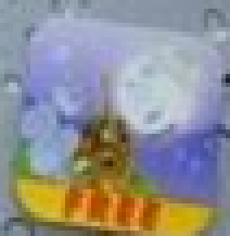
Nursery TV 3