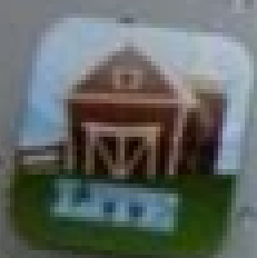
Kids Farm Free