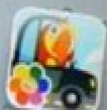
Things Go Game