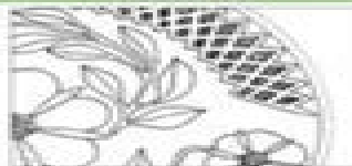
Floral and Diamond Band