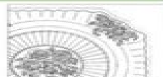
Mayfair (Open Rose)