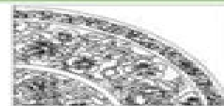
Flower Garden With Butterflies