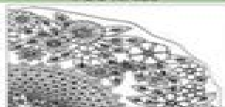
Pineapple & Floral