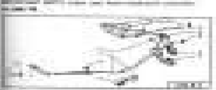
Figure 10.1: A map of the world showing the routes of exploration during the Age of Discovery.

The Age of Discovery was a period of great exploration and discovery, as European powers sought to establish trade routes to the East Indies and to the Americas. This period was characterized by the exploration of new lands and the establishment of trade routes. The Age of Enlightenment was a period of great intellectual and cultural achievement, as thinkers sought to understand the world through reason and science. The Age of Revolution was a period of great political and social change, as people sought to establish new forms of government and society.