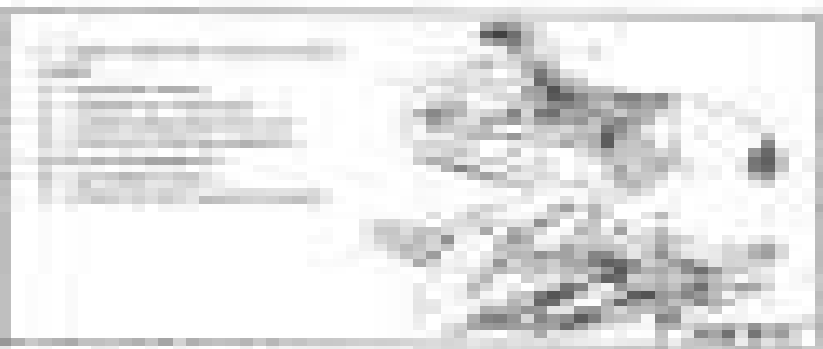
Figure 10.2: A map of the world showing the routes of exploration during the Age of Enlightenment.

The first of these is the Age of Discovery , which began in the late 15th century and lasted until the early 17th century. This was a period of great exploration and discovery, as European powers sought to establish trade routes to the East Indies and to the Americas. The second is the Age of Enlightenment , which began in the late 17th century and lasted until the late 18th century. This was a period of great intellectual and cultural achievement, as thinkers sought to understand the world through reason and science. The third is the Age of Revolution , which began in the late 18th century and lasted until the mid-19th century. This was a period of great political and social change, as people sought to establish new forms of government and society.