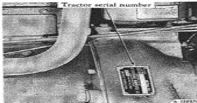
Illustr. 2 Location of tractor serial number.

When in need of parts, always specify the tractor and engine serial numbers. The tractor serial number is stamped on a name plate attached on the left side of the clutch housing. The serial number is preceded by the letters FBH for the Farmall H and FBHV for the Farmall HV. See Illustr. 2 . The engine serial number is stamped on the right side