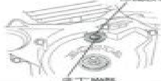
FIG INDEX MARK

Turn the crankshaft counterclockwise and align the "T" mark with the index mark of the left crankcase cover.